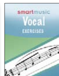
Vocal warm-ups and exercises...