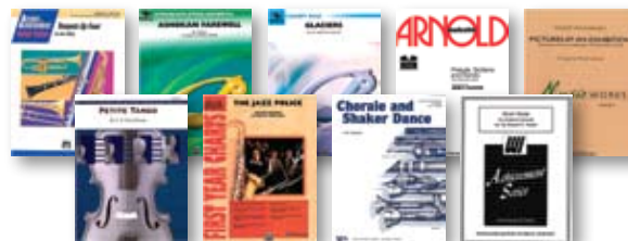
Hundreds of Concert Band, Jazz Ensemble, and String and Full Orchestra Titles, plus more each month