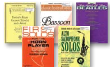
More than 7,000 Solo Titles