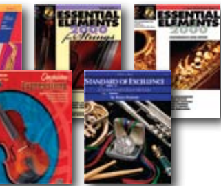
Popular Method Books