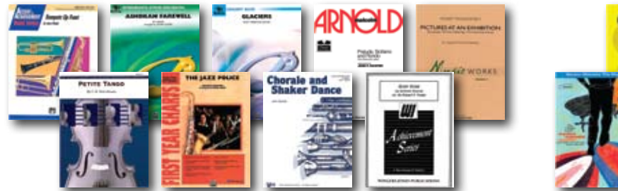
Hundreds of Concert Band, Jazz Ensemble, and String and Full Orchestra Titles, plus more each month