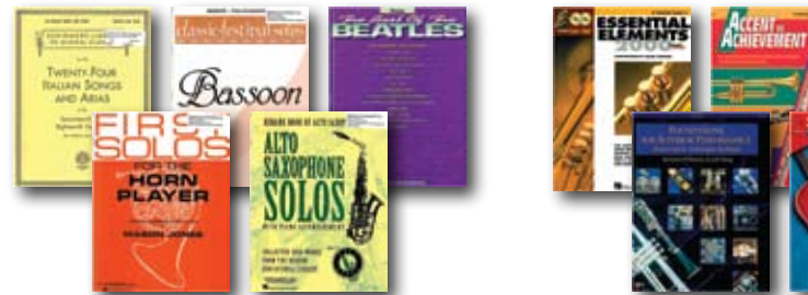
More than 30,000 Solo Titles